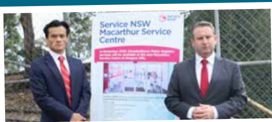
With Greg Warren MP outside the former Campbelltown Motor Registry office. Both the Campbelltown and Ingleburn Motor Registry offices were closed by the Liberal Government back in 2015.